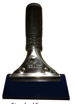
Standard Squeegee (for 3M™ FASARA™)